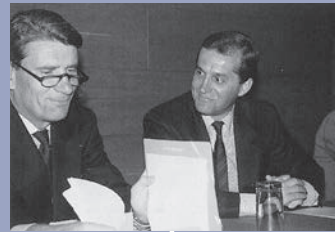
Founding of Finantia – Gestão e Consultoria Financeira Internacional, S.A.

We started by making a difference in the financial sector in Portugal, and ten years later we began our expansion overseas, whilst adding new business areas. We keep evolving with optimism, confidence, responsibility, unconditional staff support and pride in our independence.