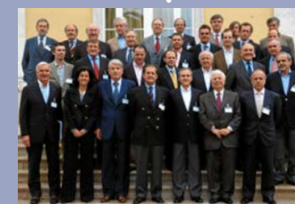
Euromoney award "Best Smaller Bank in Europe"