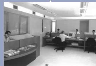
Beginning of the international expansion (London, Sao Paulo and New York)