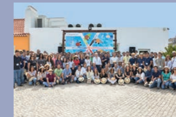
Team building at the Portuguese Association for Asperger's syndrome