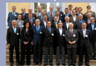
Euromoney award "Best Smaller Bank in Europe"