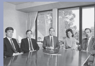
Finantia obtains banking license