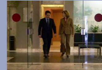
Beginning of the Private Banking activity expansion