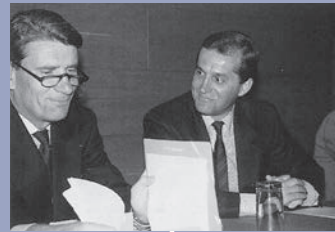
Founding of Finantia – Gestão e Consultoria Financeira Internacional, S.A.

We started by making a difference in the financial sector in Portugal, and ten years later we began our expansion overseas, whilst adding new business areas. We keep evolving with optimism, confidence, responsibility, unconditional staff support and pride in our independence.