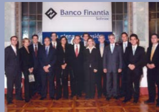
Acquisition of Banco Finantia Spain